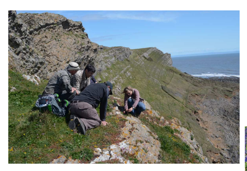
City and County of Swansea

Without human intervention many species will be lost